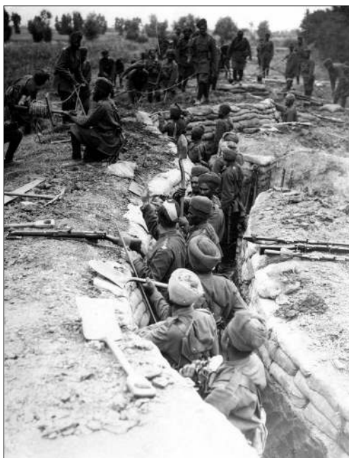
Sepoys at war

The Muslim League and Congress were both calling for self-government by 1913. The Muslim League, however, had to be careful: if the British left India before safeguards were in place, Muslims would not gain self-rule. They would be dominated by the Hindus and could expect little say in how they were governed. Congress had to be convinced that they needed to work with the Muslim League in order to win their support in the search for self-rule. In December 1916 the first and only meeting was held between the leaders of the Muslim League and Congress, which led to a joint proposal to put in front of the British.